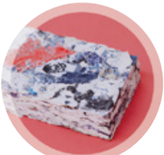
BRICKS, CONCRETES AND CEMENTS