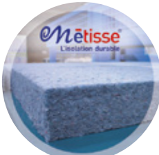
NONWOVENS FOR STRUCTURAL INSULATION OF BUILDINGS