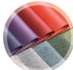
YARN FOR TECHNICAL WOVEN OR KNITTED FABRICS (continuous filaments)