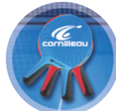
SPORTING GOODS / GARDEN FURNITURE / SPARE PARTS