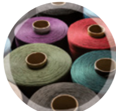
YARN FOR WOVEN OR KNITTED FABRICS