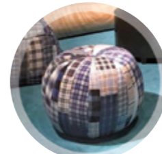
SEWING OF FABRIC CUTS