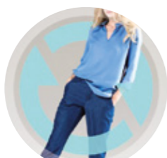
YARN FOR WOVEN OR KNITTED FABRICS