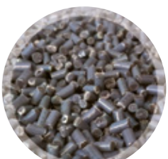
SOLID RECOVERED FUEL