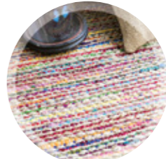
WOVEN OR KNITTED FABRIC SCRAPS