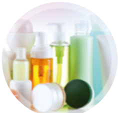
PLASTICS (packaging, polymers...)