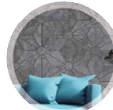
NONWOVENS FOR INSULATION AND DECORATION OF BUILDINGS