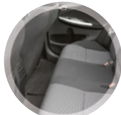
NONWOVENS FOR THE AUTOMOTIVE INDUSTRY