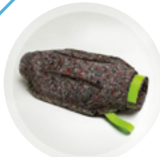
MOULDED NONWOVENS FOR BUILDING EQUIPMENT